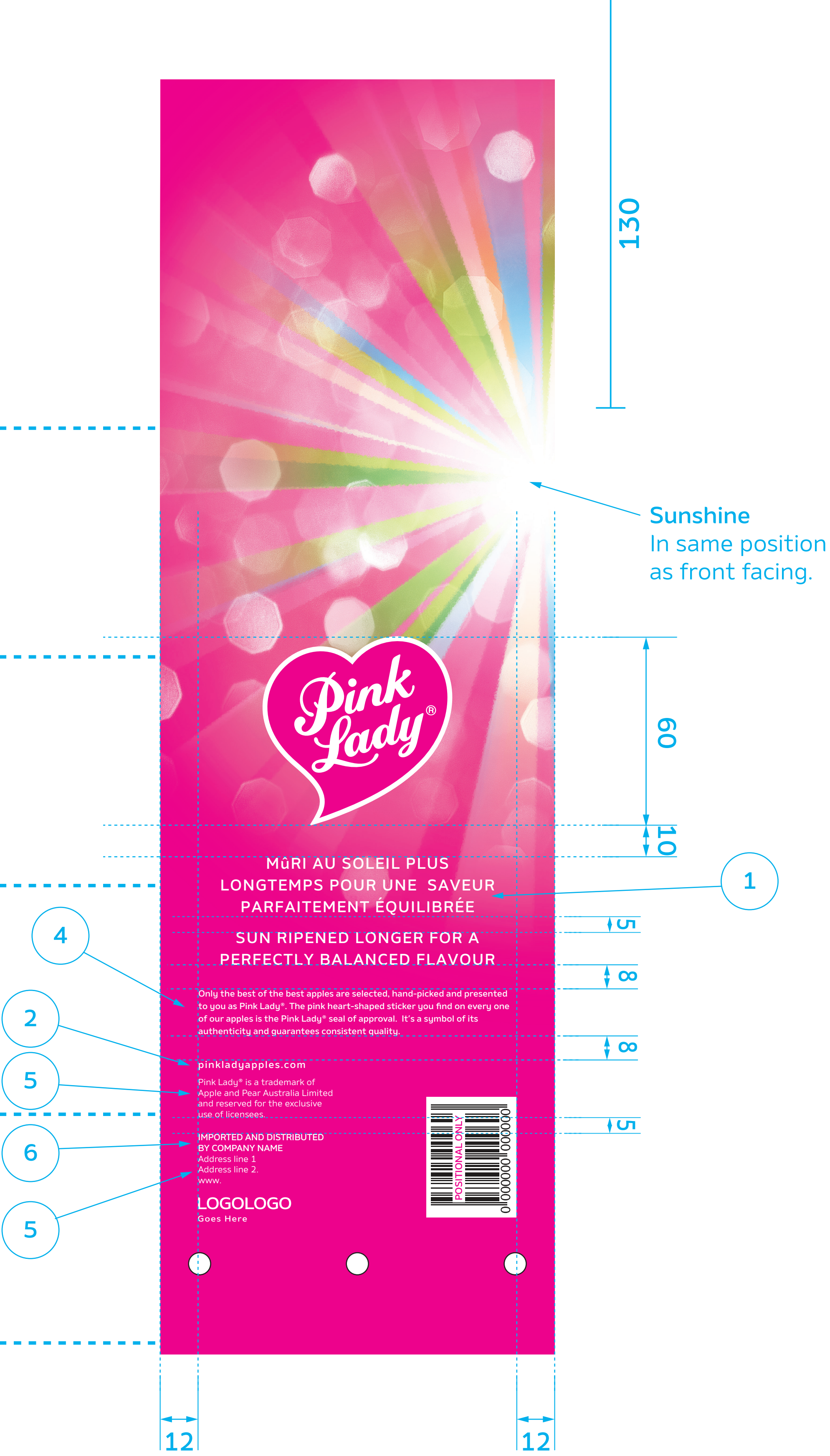
Dual language Sun-Ripened statement