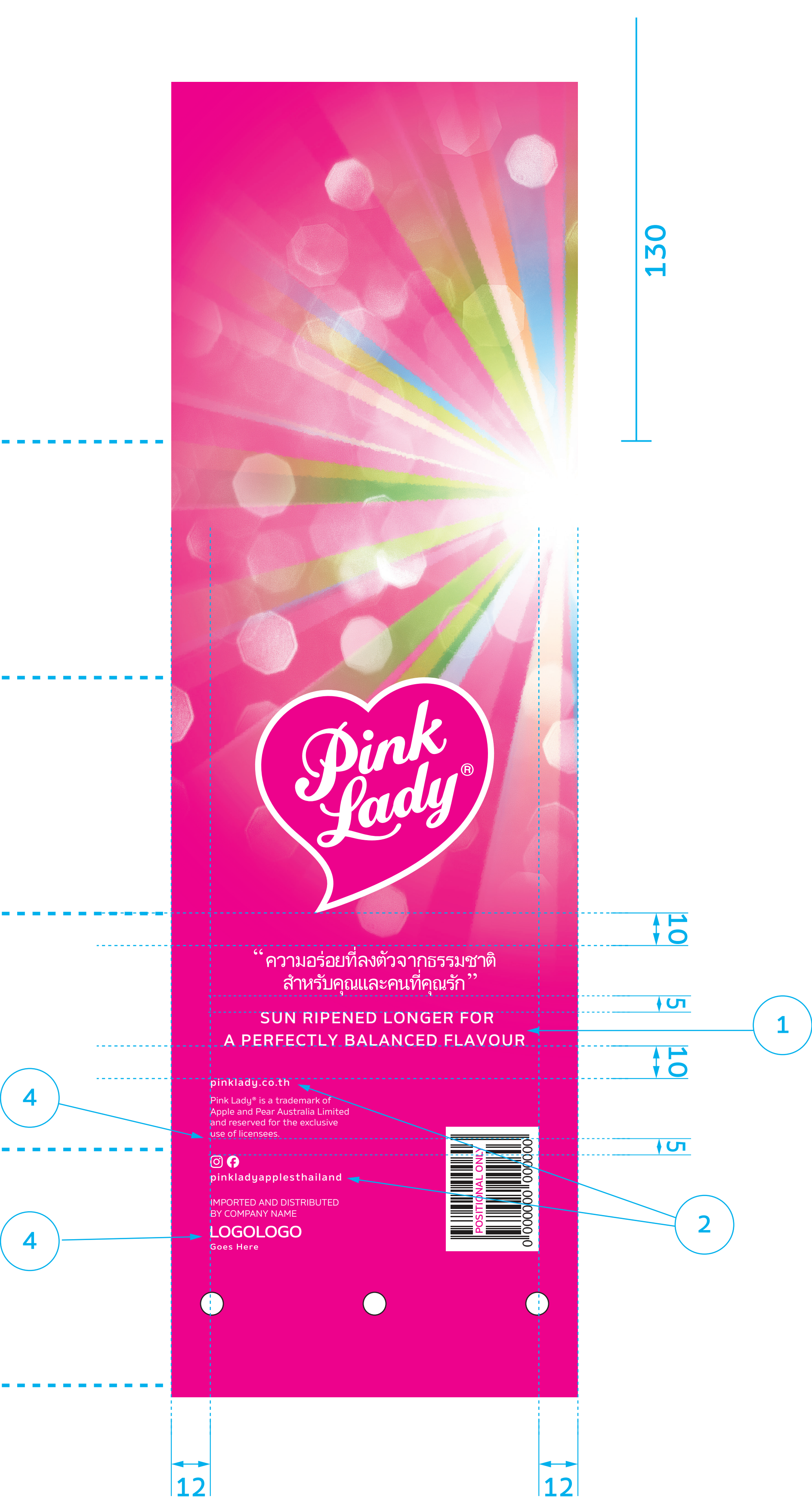
Dual language Sun-Ripened statement and social media contacts